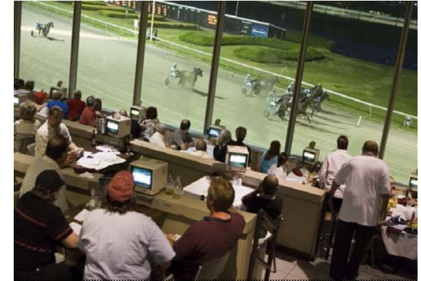
Recognized by the Detroit News as one of Detroit's Best Action & Affordable Night Spots